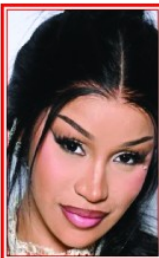
Cardi B Makes Hilarious Admission About Personal Hygiene