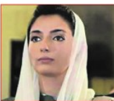
Shaheed Mohtarma Benazir Bhutto