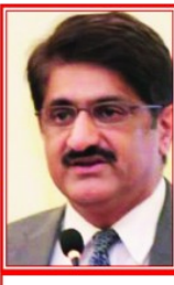
Sindh Approves Rs55 Billion Package to Support Wheat Cultivation on 2.2 Million Acres

KARACHI: Edition Vol. XVI No 287 Regd. No. 114 visit us at