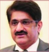
Murad Ali Shah

Chairing a high-level meeting, the Chief Minister was briefed that 412,000 small farmers are being provided with urea and DAP fertilizers to ensure timely sowing. He