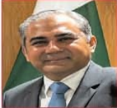
Pakistan Army officers and soldiers who successfully thwarted the assault and rescued cadets and teachers. He lauded their bravery, professionalism, and swift response, saying their courage exemplifies the nation’s resilience in the face of terror.