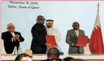
November 15, 2025 Doha / State of Qatar

It was the latest of several documents that have been signed in recent months as part of efforts, backed by the United States and Qatar, to end the decades-long conflict in