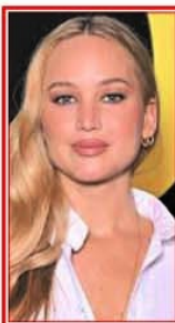
Jennifer Lawrence Opens Up About the Fear She Never Escapes